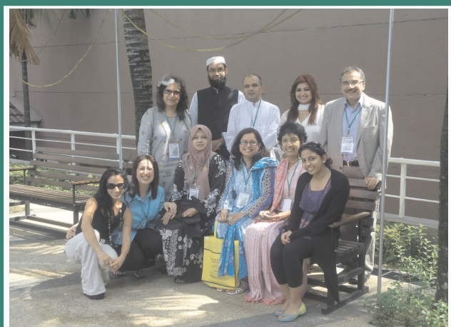
The Pakistani delegation at the ABA Conference in Kuala Lumpur in August 2012 was the second largest in the meeting after that of the host country. The picture shows “Team Pakistan” with friends.