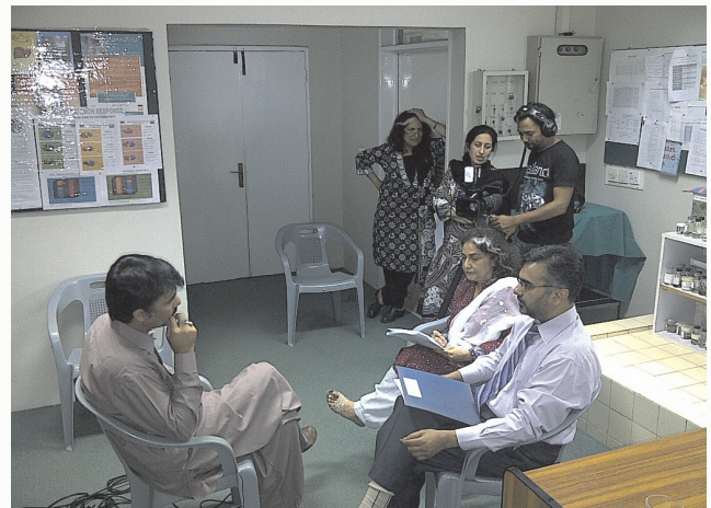
Shooting in progress for the video "More than meets the eye." On the left, a scene filmed in the SIUT library (at 11.00 pm) depicts a group of healthcare professionals discussing the case of a quadriplegic child. The picture on the right, shot in a hospital seminar room, pictures a surgeon and a psychologist speaking with the patient's brother.